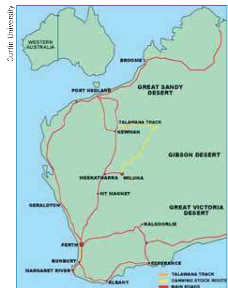
The Canning Stock Route is marked in yellow.

However, his notes on his journey from Halls Creek back to Wiluna show more detail. He includes multiple