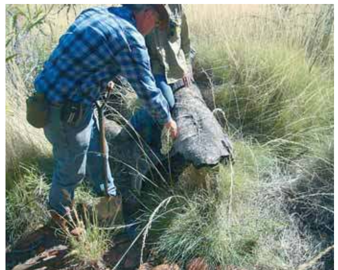
The remains of a reference tree blazed by AW Canning, Diebel Springs

The vehicle left at the morning's camp would wait its allotted GPS baseline time and then move to the day's next