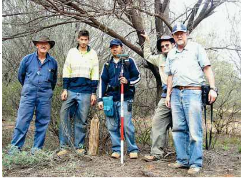
Canning's Original Post No. 2 and the successful survey crew