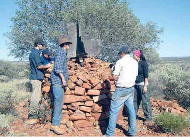
The trig station cairn above PA61, McGonky Hill