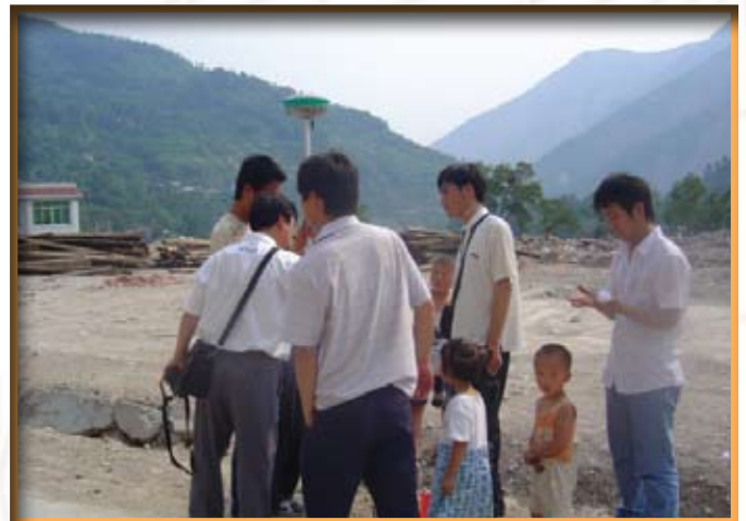
▲ Team members survey among the rubble of a village.

Surveying in the aftermath of a local disaster demands perseverance, patience, compassion, and a dedicated, experienced survey team. On May 12, 2008, the earth beneath the Sichuan Province of western China shifted, generating a massive magnitude 8.0 earthquake. Although the three-minute earthquake was felt throughout China and Southeast Asia, the Sichuan Province was hardest hit.