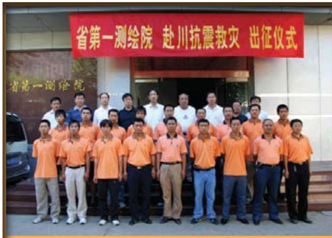
▲ HBSM survey teams before leaving on the 1,243-mile journey to Sichuan Province.

After the Great Sichuan Earthquake destroyed many villages and homes in China, survey crews set out to begin the rebuilding process.