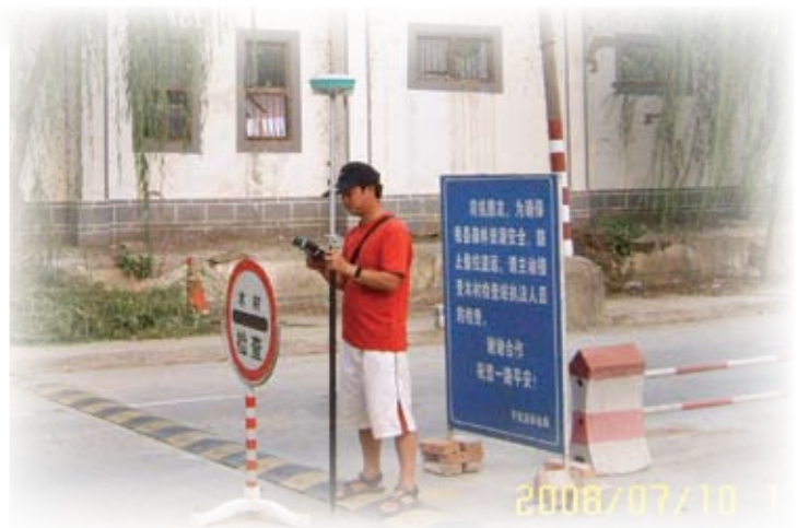
▲ Using a Sokkia GSR2700 ISX receiver as a rover to re-establish lost boundaries and control points.

The Sichuan Province is far from the ideal location for performing a survey. Surrounded by the Himalayan Mountains to the west, the Qinling Range to the north, and the moun-